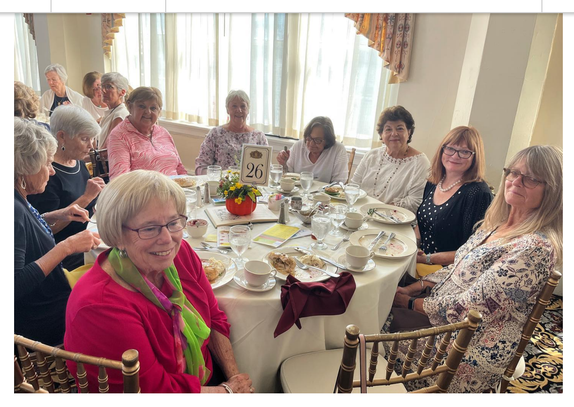
Fun for Us Fundraiser at Maynard's